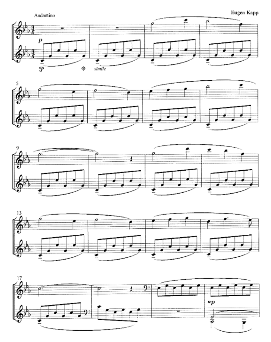
Alle Rechte vorbehaben / All rights reserved. Verweltsingung signifier Art sit gestetzleb verbotten / Anv unauthonzed reproduction a prohibered by Inst. © 2010 by Eres Edition, D-28865 Lilienthal / Bremen, P.O. Box 1220