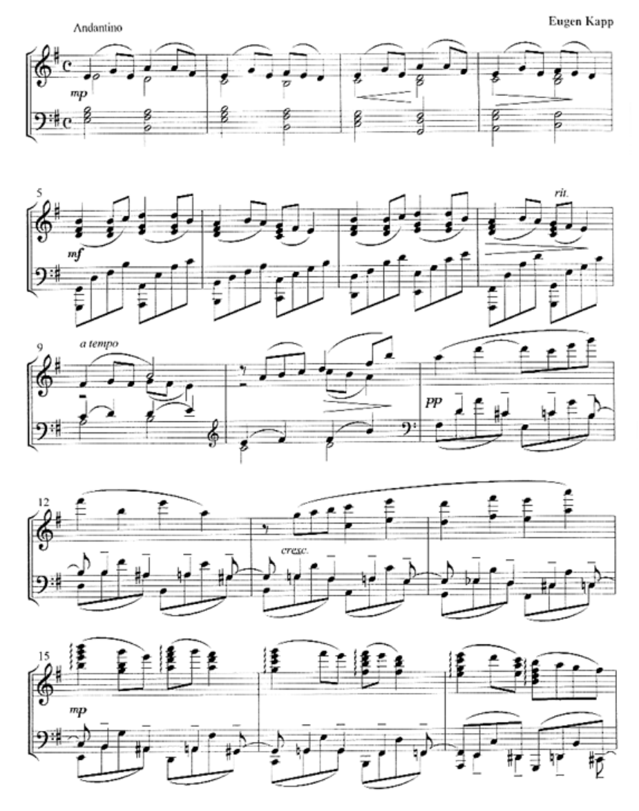
Alle Rechte vorbehalten / All sights reserved. Versordungung segichtet Art ist getetzlich verboten / Any unsuchorized reproduction is prohibited by law. © 2010 by Eres Edition, D-28865 Lilienthal / Brettnen, P.O. Box 1220 Eres 2867