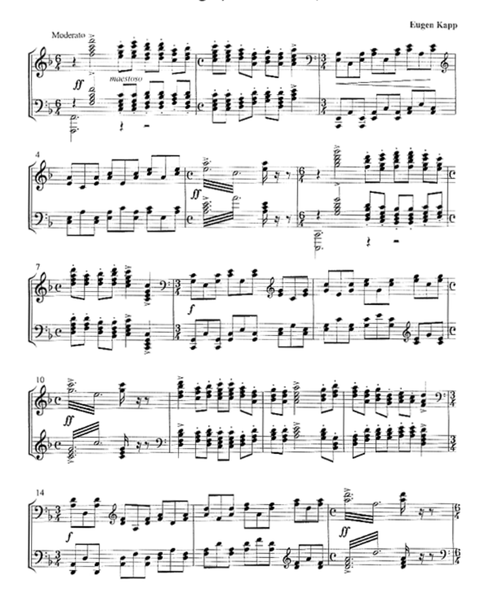
Alle Rechte verbehahren. / All nights teservoll. Vervielrälingung seglicher Art im gesetzlich verboten. / Anyumumbonised reproduction in prohibited by law. © 2010. by Eres. Edition, D-28865. Lilienthal. / Bremen, P.O. Box 1220. Eres. 2867.